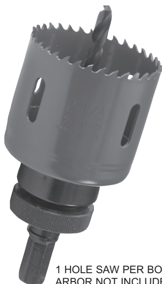
1 HOLE SAW PER BOX. ARBOR NOT INCLUDED.