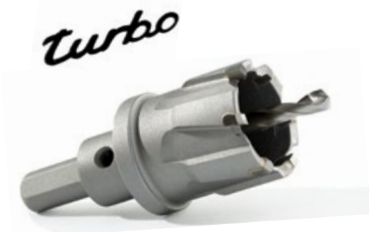
1-3/8" Cutting Depth