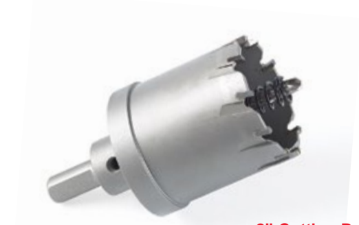
2" Cutting Depth