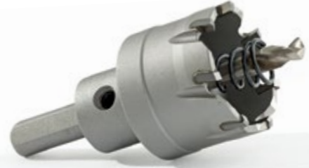
1/2" Cutting Depth