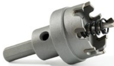
3/16" Cutting Depth