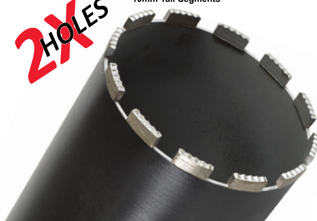
10mm Tall Segments