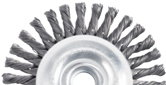
Stringer Bead Wheel