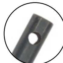
FISH HOLE ON SHANK