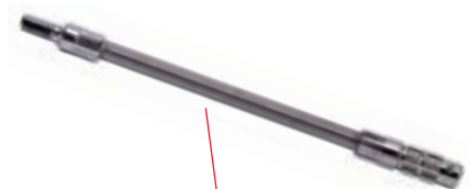
Flexible shaft can bend up to 45° for those hard to reach areas.