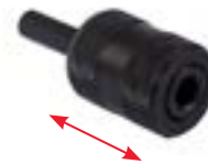
Chucks have a quick insert / quick spring out system for easy bit changing. Locks in bits. Use with 2"+ POWER bits only!!!