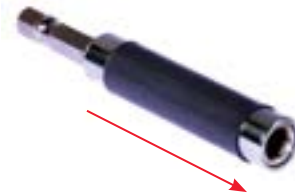
Sleeve extends up to 8" (on 5" length sleeve guide) to hold screw while fasteneing.