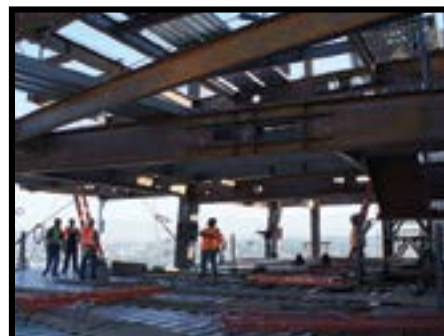
Structural Steel Erection