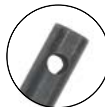
FISH HOLE ON SHANK