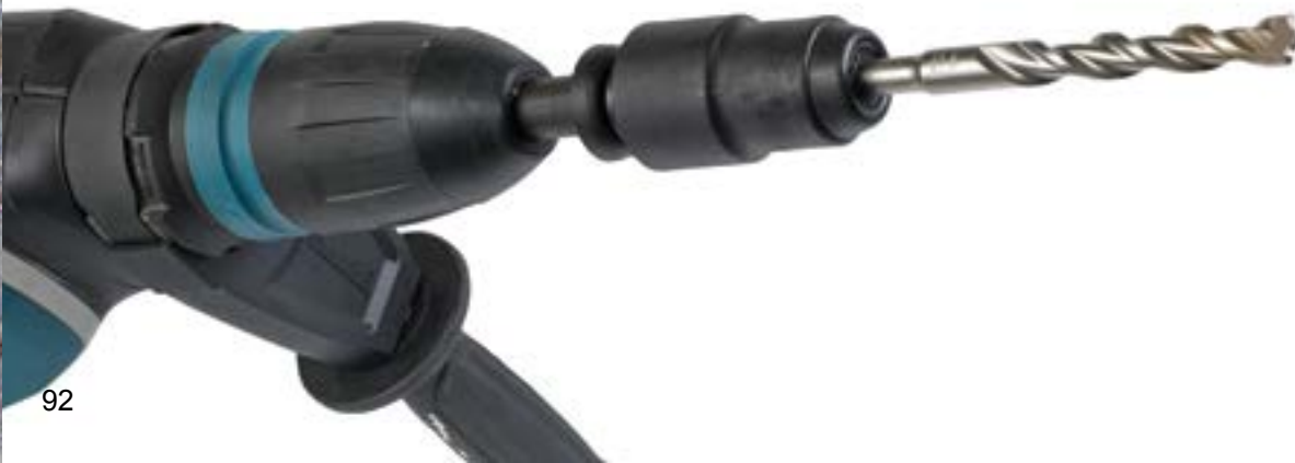
SDS-Max to SDS-Plus Adapter