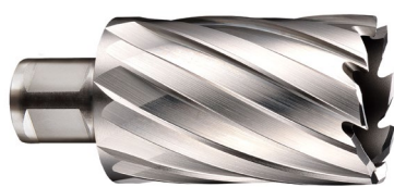
2" Cutting Depth