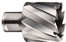
1" Cutting Depth