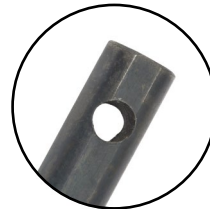
FISH HOLE ON SHANK