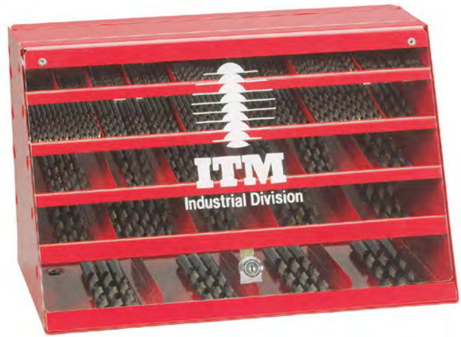
DISPLAY - PART# 13125 14" Out X 15"H X 12"W

This attractive drill bit merchandiser puts all 29 essential jobber sizes at your fingertips. Made of heavy duty steel construction, this deep red cabinet dispenser fits perfectly on any counter top. Comes with lock and key.