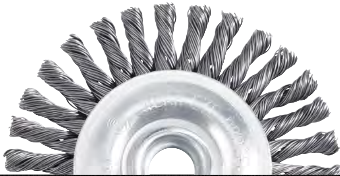
Stringer Bead Wheel