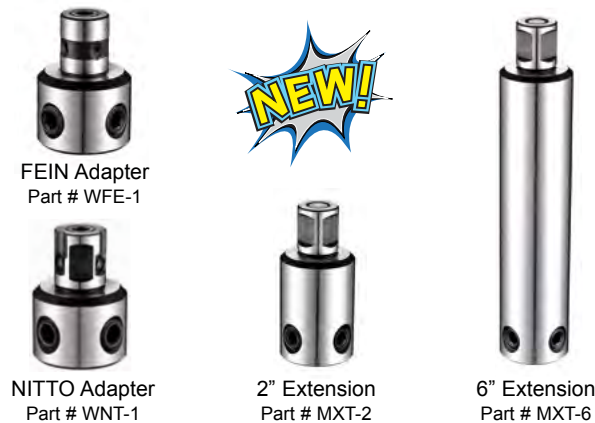
FEIN Adapter Part # WFE-1

For Enlarging Holes in Steel Plate up to 1/2" Thick!