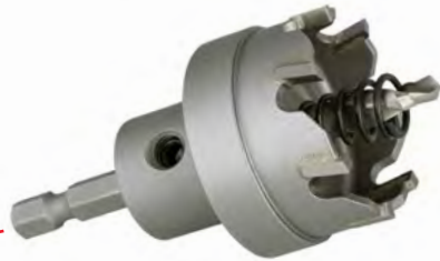
3/16" Cutting Depth