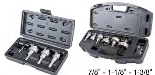
7/8" - 1-1/8" - 1-3/8" 1-3/4" - 2" - 2-1/2"