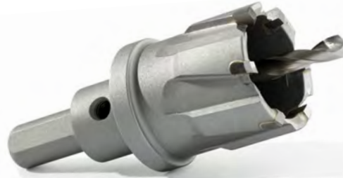
1-3/8" Cutting Depth