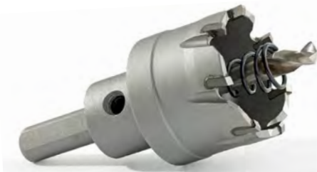
1/2" Cutting Depth