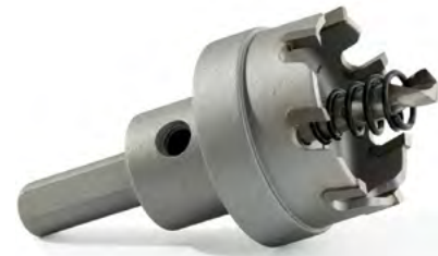
3/16" Cutting Depth