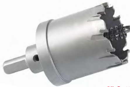
2" Cutting Depth

T.C.T. HOLE CUTTERS ARE SOLD INDIVIDUALLY.