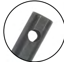
FISH HOLE ON SHANK